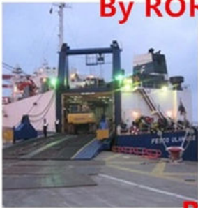
By RORO Shipping