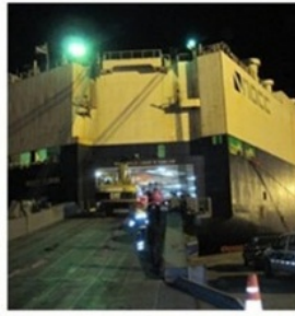
By Bulk Cargo