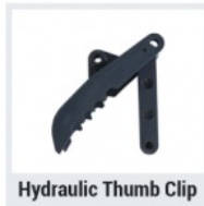
Hydraulic Thumb Clip