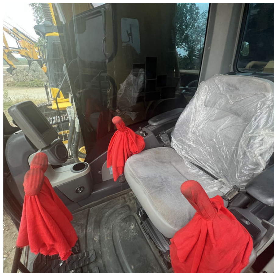
Contact us for a full picture and video of this machine!