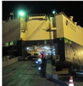
By Bulk Cargo